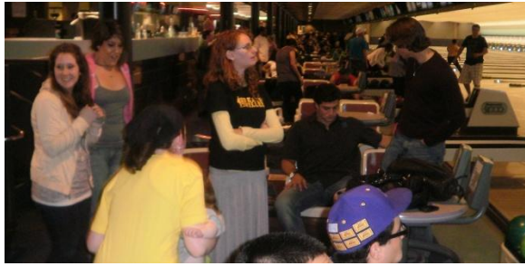
Students at Beach Hillel's March 11 th bowling event